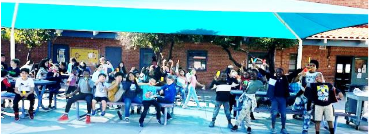
Perfect Attendance Group